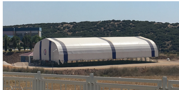
Figure 14. Sport center