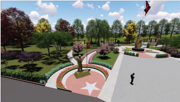
Figure 11. 15 Temmuz Şehitleri Park