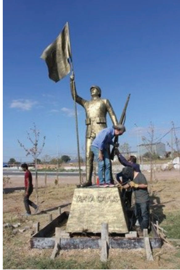
Figure 12. Ezineli Yahya Çavuş Monument