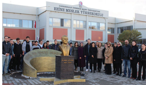
Figure 13. Atatürk's Bust