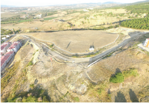
Figure 8. A view of The Observation Area of Çanakkale Müstahkem Mevkii Karargahı