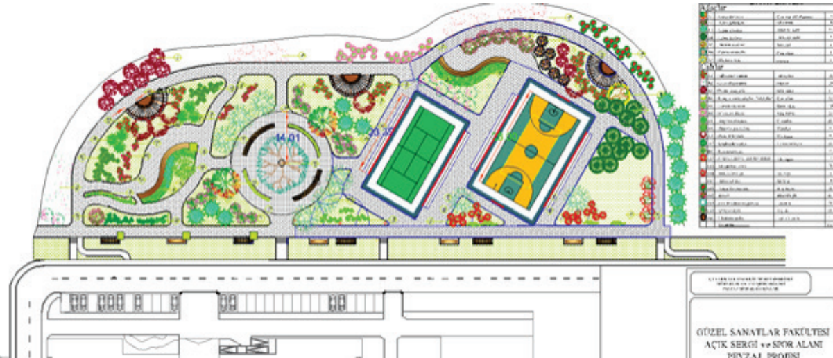
Figure 2. Landscape design project of outdoor sport and exhibition area of Fine Arts Faculty

In Figure 2, it has given recreational land uses. It contains sport areas, vistas, exhibition areas, amphitheatre, pergolas, green areas. Some applications in this area have been continuing (Figure 3).