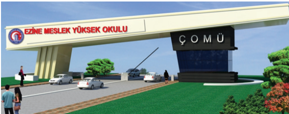
Figure 10. Entrance Gate