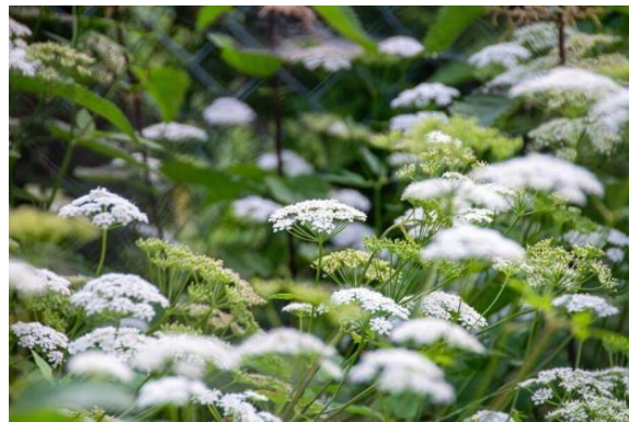
Figure 4. Nepeta cataria [14]

Cat Grass ( Nepeta cataria ): This plant is particularly attractive to cats, fulfilling their need for play and relaxation (Figure 4).