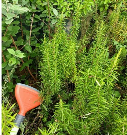
Fig. 2. Rosmarinus officinalis [12]

Mint ( Mentha spp.): Mint is known for its digestive properties when consumed by animals and is good for stomach ailments. It also adds a fresh scent to the garden (Fig. 3).