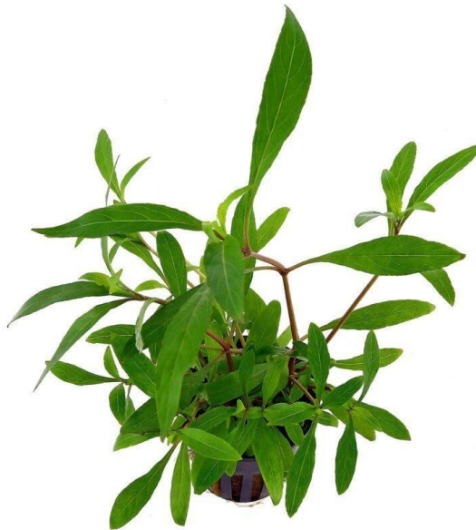
Figure 8. Nicotiana spp. [18]

Tobacco Plant ( Nicotiana spp.): This plant is toxic to animals due to its nicotine content and can cause nervous system disorders (Fig. 8).