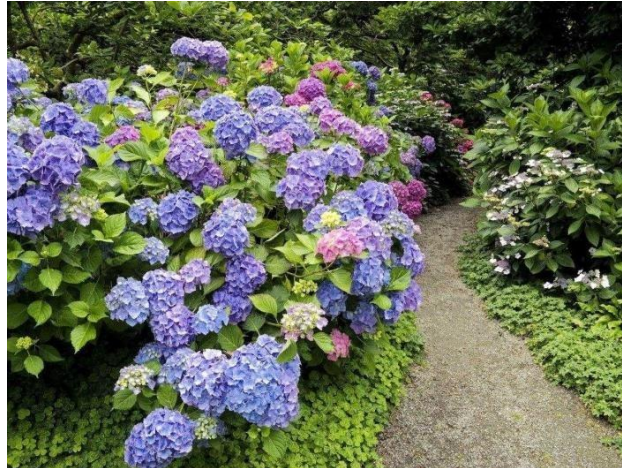
Figure 7. Hydrangea spp. [17]

Tobacco Plant ( Nicotiana spp.): This plant is toxic to animals due to its nicotine content and can cause nervous system disorders (Fig. 8).