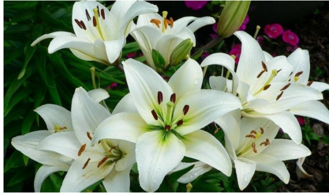
Fig 5. Lilium spp. [15]

Lily ( Lilium spp.): The lily is highly toxic, especially to cats, and can cause kidney failure if consumed (Fig. 5).