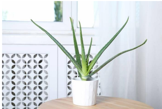
Fig 6. Aloe barbadensis miller [16]

Aloe Vera ( Aloe barbadensis miller): Aloe Vera can cause symptoms such as vomiting, diarrhea and tremors in pets when consumed (Fig. 6).