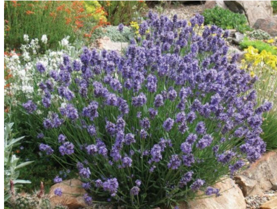
Fig. 1. Lavandula angustifolia [11]

Lavender ( Lavandula angustifolia ): Lavender is known for its soothing effect when consumed for animals and can help reduce stress in pets. It also makes an aesthetic contribution to the garden with its pleasant scent and attractive flowers (Fig. 1).