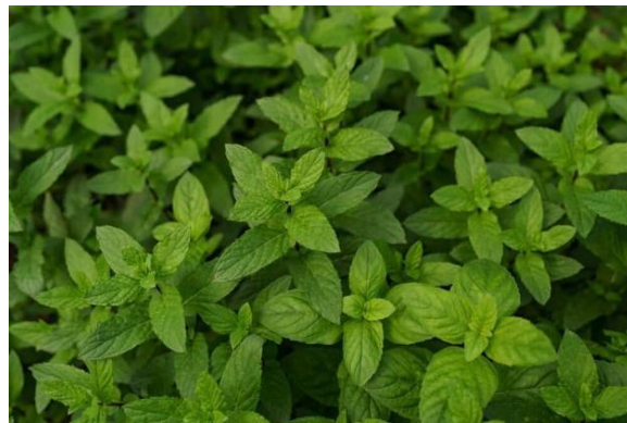
Fig. 3. Mentha spp. [13]

Mint ( Mentha spp.): Mint is known for its digestive properties when consumed by animals and is good for stomach ailments. It also adds a fresh scent to the garden (Fig. 3).